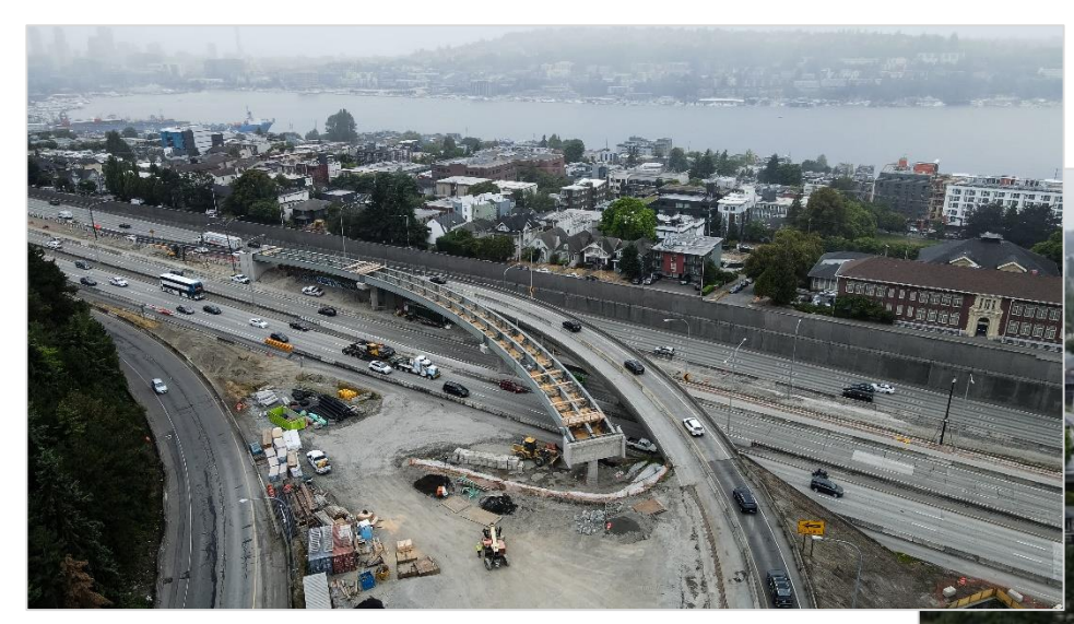
Aerial photos taken in early August showing flyover ramp construction